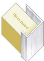
Edge Trim - GA PTE1603

GA Helpline 020 8692 2255 Mon-Fri 8.30am-5pm for professional assistance