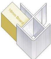
External Corner - GA PTE1602